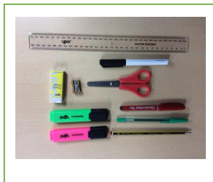
Things I will need